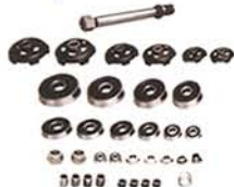
Kit Opcional de adaptadores especiales