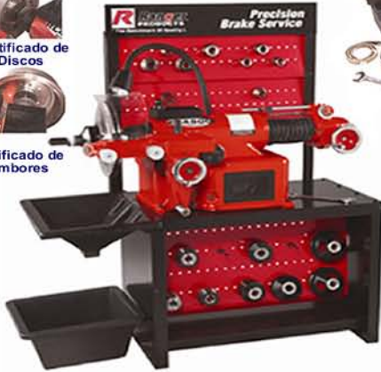
MODELO RL 4500 RECTIFICADOR DE DISCOS Y TAMBORES CON JUEGO ESTÁNDAR DE ACCESORIOS